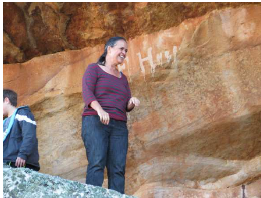
A large south-facing overhang